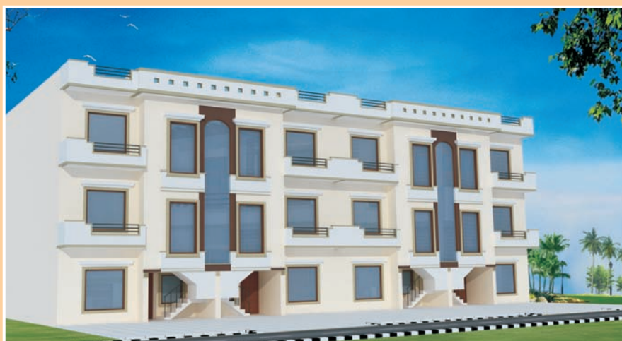
PROPOSED FLOORS AT VRINDAVAN