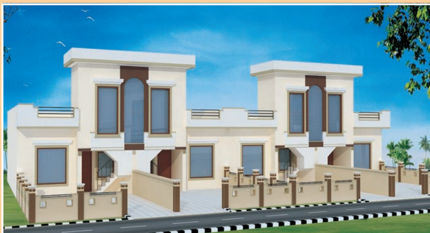
PROPOSED VILLA AT VRINDAVAN